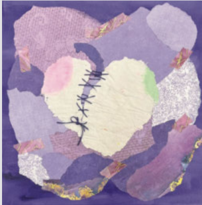
Art by Tanya Gross