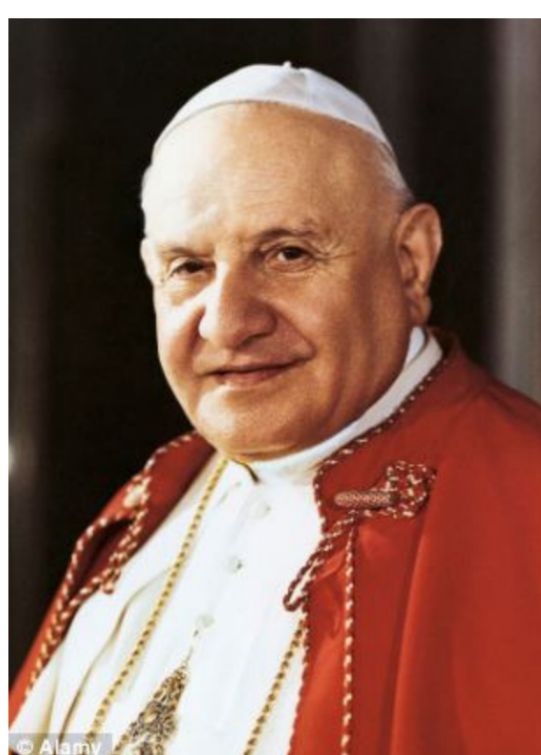
St. John XXII