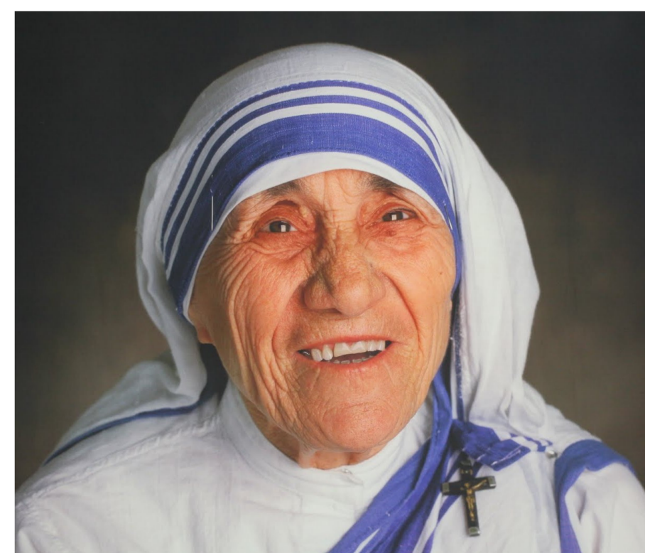
St. Teresa of Calcutta