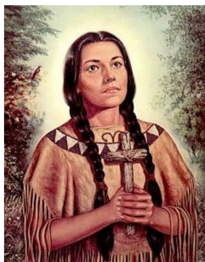
St. Kateri Tekakwitha