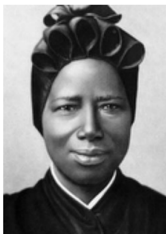
St. Josephine Bakhita